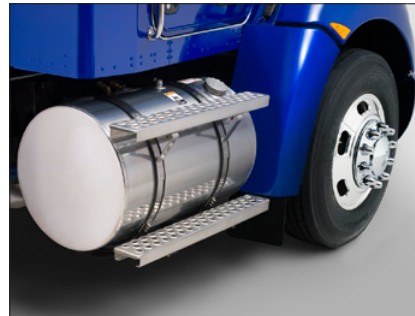
To add a distinctive look to your T470, Kenworth offers a wide variety of chrome and polished options. Polished aluminum wheels, fuel tanks and DEF tank covers are just few.