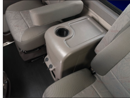
Optional center console with two power ports, cup holder and convenient storage makes the perfect in-cab workstation.