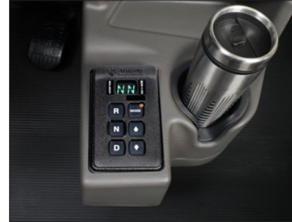
Easy-to-reach and operate dash control panel for Allison automatic transmissions. Also incorporates a handy cup holder.