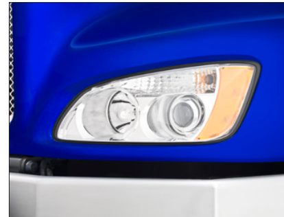
An advanced forward lighting system provides up to 30% more down-road coverage than conventional sealed beam designs.