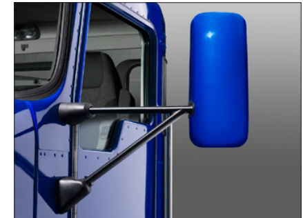
Heated and electronically-controlled aerodynamic mirrors minimize road spray, keeping visibility at a maximum.