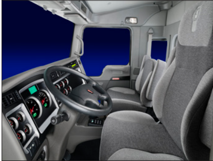
The fully-trimmed standard Summit interior shown with optional Kenworth Air Cushion Plus high back driver seat and Kenworth Toolbox Plus low back passenger seat.

Your T470 is available with plenty of job-specific and appearance options. Here are just a few of them.