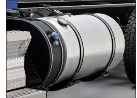
DEF tanks in three sizes complement your choice of fuel tank size and provide fill interval options appropriate for your application. Fuel tanks in 22" and 24.5" range in size from 56 to 150 gallon, to offer clear back of cab configurations.