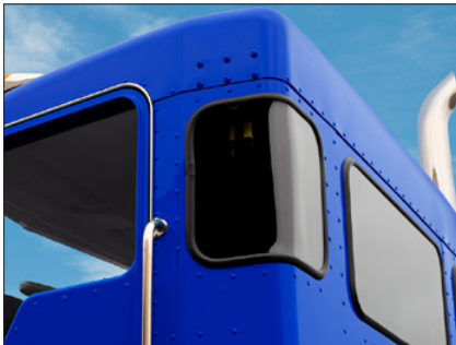
Cab corner windows greatly enhance visibility in tight places.